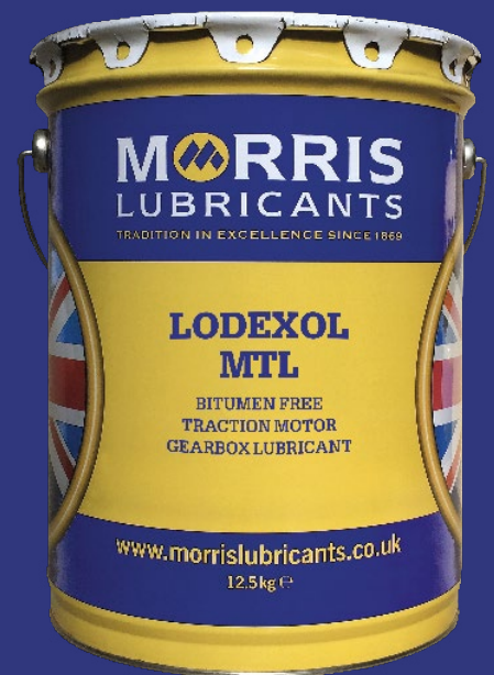
A5_Diesel Locomotive Products_v1_1115